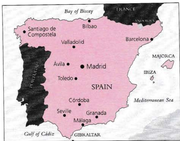
Map of modern Spain